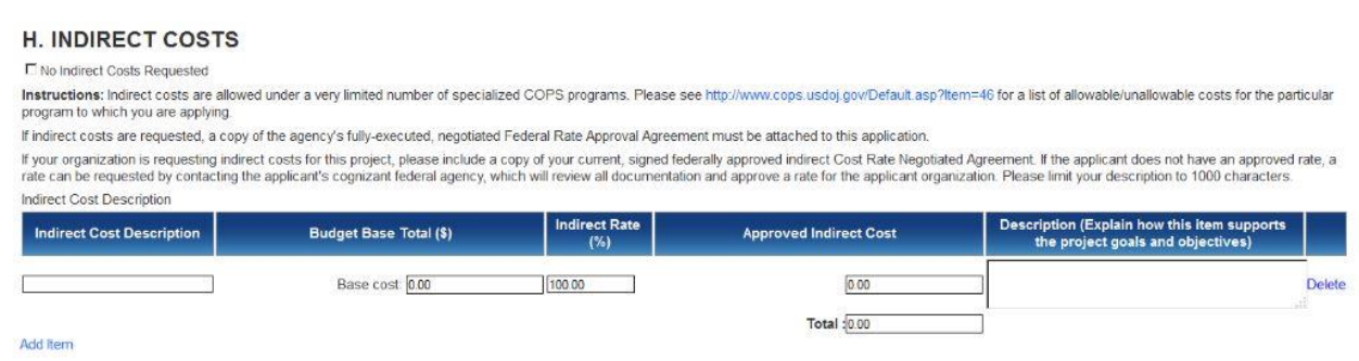
Figure 9. Screenshot of indirect cost calculations