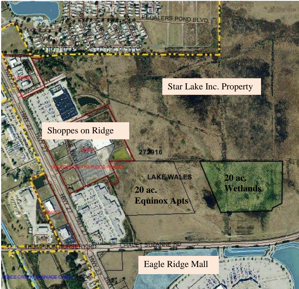
Aerial Photo – 2011 Equinox Properties – north of Chalet Suzanne Rd.