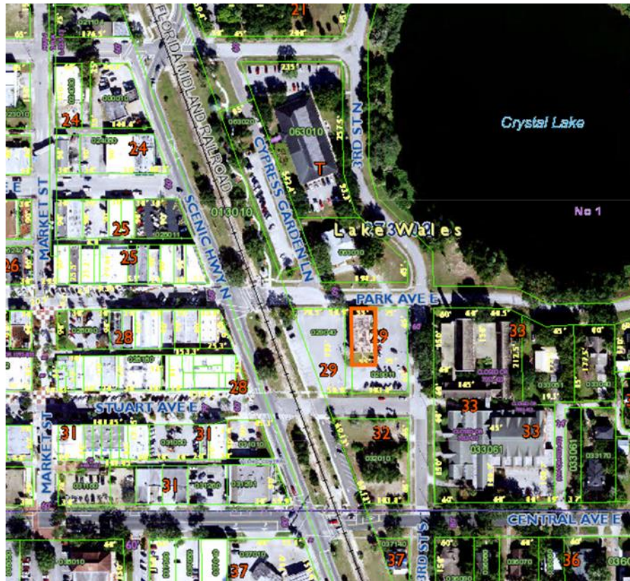
Location of Site