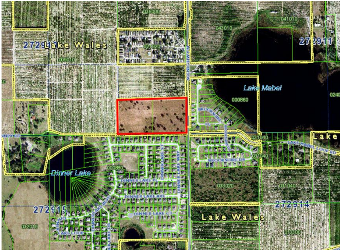
Location of Site

Parcel ID: 272910-000000-022020 & 272910-000000-022030