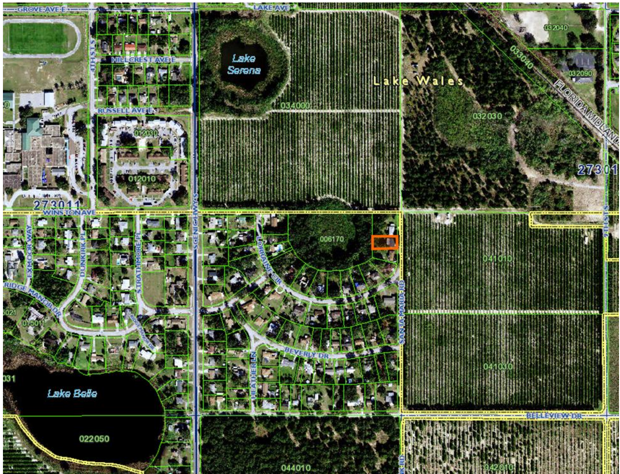
Location of Site