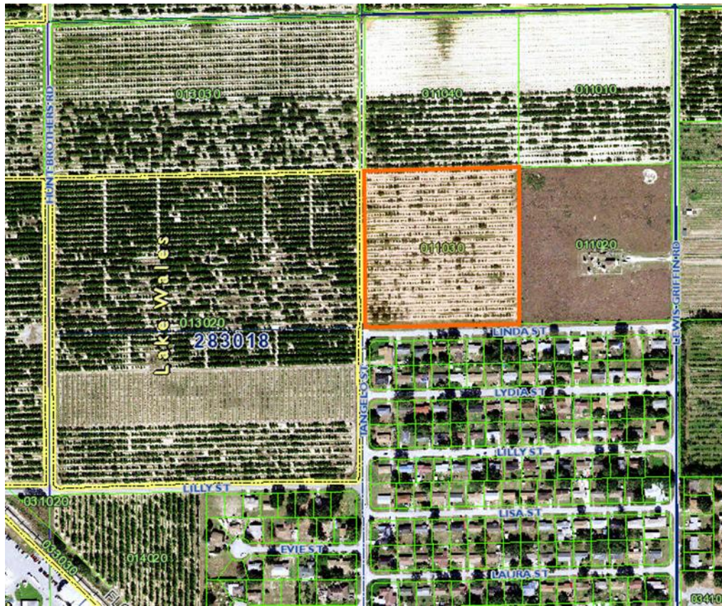
Location of Site