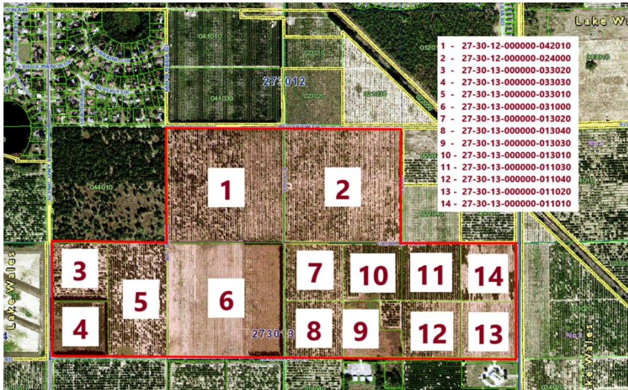
Aerial of Subject Property

Parcel ID: 273013-000000-011010, 273013-000000-011020, 273013-000000-011030, 273013-000000-011040, 273013-000000-013010, 273013-000000-013030, 273013-000000-013020, 273013-000000-013040, 273012-000000-024000, 273013-000000-031000, 273013-000000-033010, 273013-000000-033020, 273013-000000-033030, 273012-000000-042010