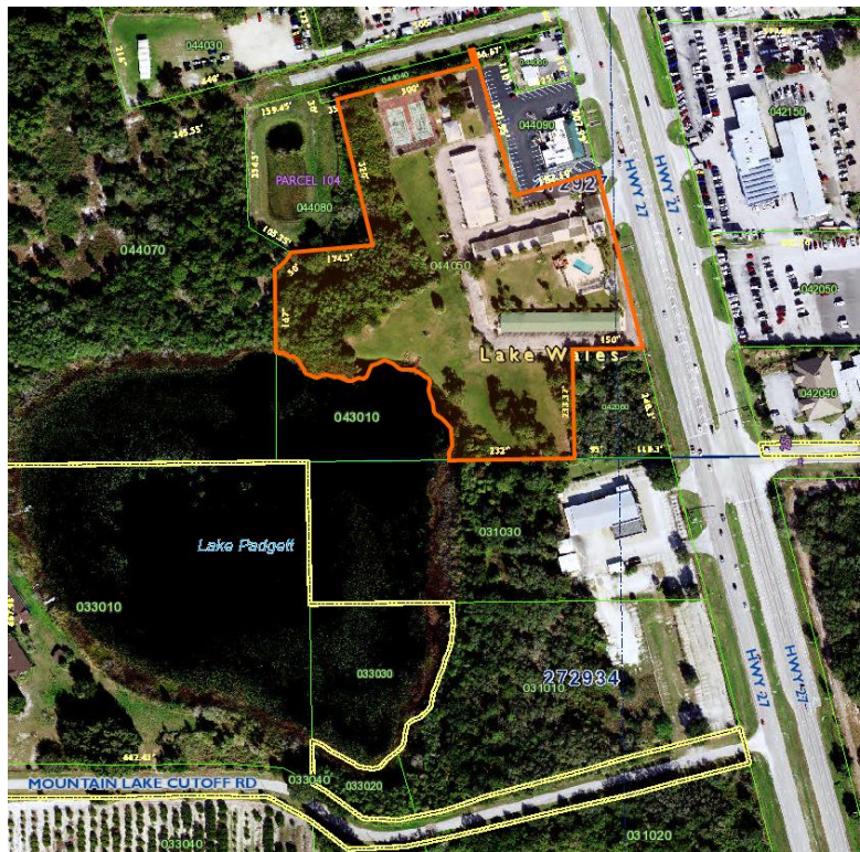
Aerial of Subject Property

COMM SE COR OF SW1/4 OF SW1/4 RUN E 110.3 FT TO HWY NWLY ALONG W R/W HWY 240.3 FT TO POB CONT NWLY ALONG HWY 594.7 FT S 76 DEG 17 MIN W PERP TO HWY 125 FT N 13 DEG 43 MIN W PARALLEL TO HWY 110 FT S 76 DEG 17 MIN W 75 FT S13-43-E 30 FT S 13 DEG 43 MIN W 300 FT S 13 DEG 43 MIN E PARALLEL TO HWY 320 FT S 85 DEG 13 MIN W 174.50 FT SWLY ALONG CURVE 50 FT S 0 DEG 21 MIN E 167 FT M/L TO LK ELY & SLY ALONG WATERS EDGE TO S BDRY OF SW1/4 THENCE E 232 FT M/L TO A PT 95 FT W OF SE COR OF SW1/4 OF SW1/4 N 233.37 FT E 150 FT TO POB LESS COMM SE COR OF SW1/4 OF SW1/4 THENCE E 110.35 FT TO WLY R/W LINE OF US 27 N14-23-06W ALONG SAID WLY RW LINE 627.01 FT TO POB S74-24-51W 182.19 FT N16-04-50W 321.95 FT N75-36-54E 66.67 FT S14-23-06E 110 FT N75-3654E 125 FT TO SAID WLY RW LINE OF US 27 S14-23-06E ALONG SAID WLY RW 207.99 FT TO POB