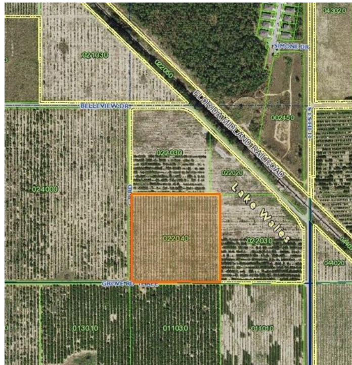
Aerial of Subject Property