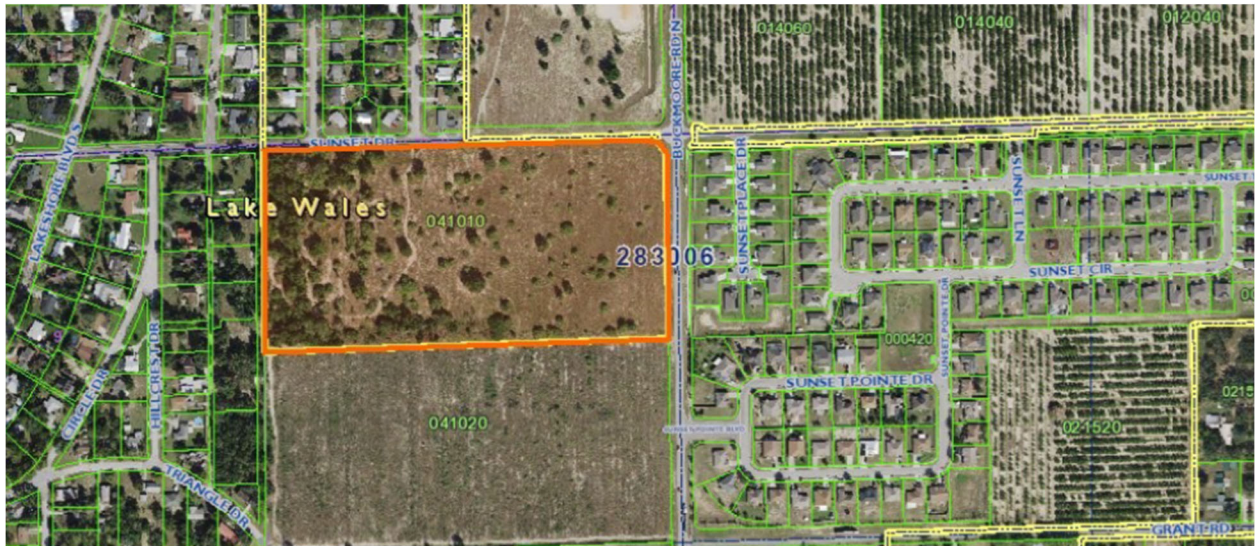
Aerial of Subject Property

N1/2 OF NE1/4 OF SW1/4 LESS R/W ON BUCK MOORE RD