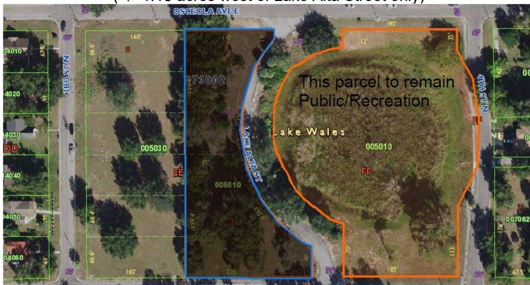
Aerial of Subject Property

ALTA VISTA PB 5 PG 12 BLK EE LOTS 1 & 2 & BLK FF ALL LOTS (+/- 1.18 acres west of Lake Alta Street only)