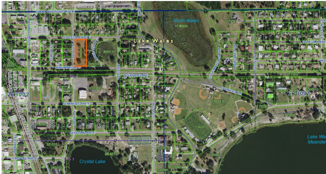
Aerial of Subject Property

ALTA VISTA PB 5 PG 12 BLK EE LOTS 3 THRU 8