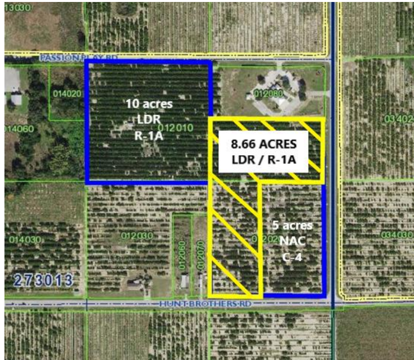
Land use designation of LDR for 8.66 acres.

Parcel ID: 273013-000000-012010 & 273013-000000-012020