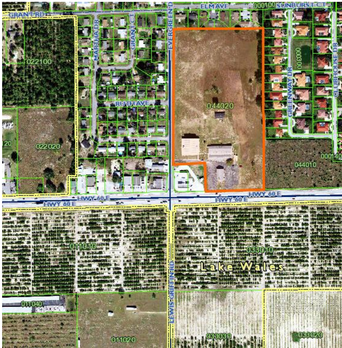
Location Map of Site