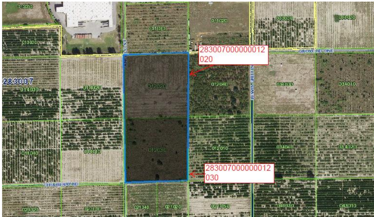
Attachment "A": Location Map of subject properties